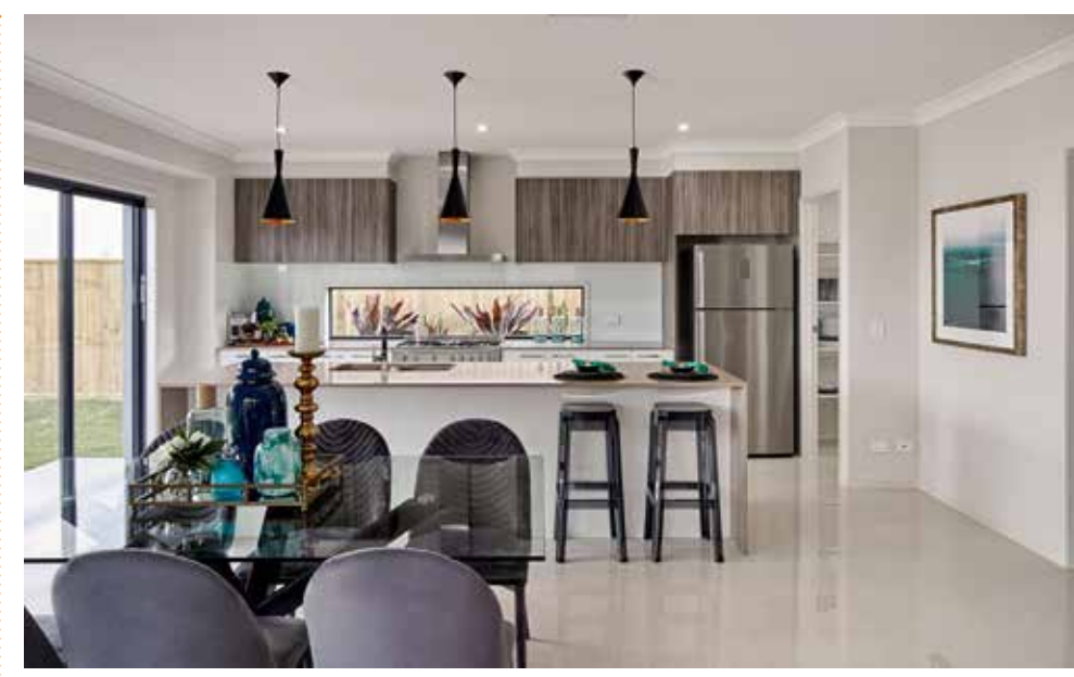
This image contains internal or external luxury upgrade items and furniture not included in the home price.